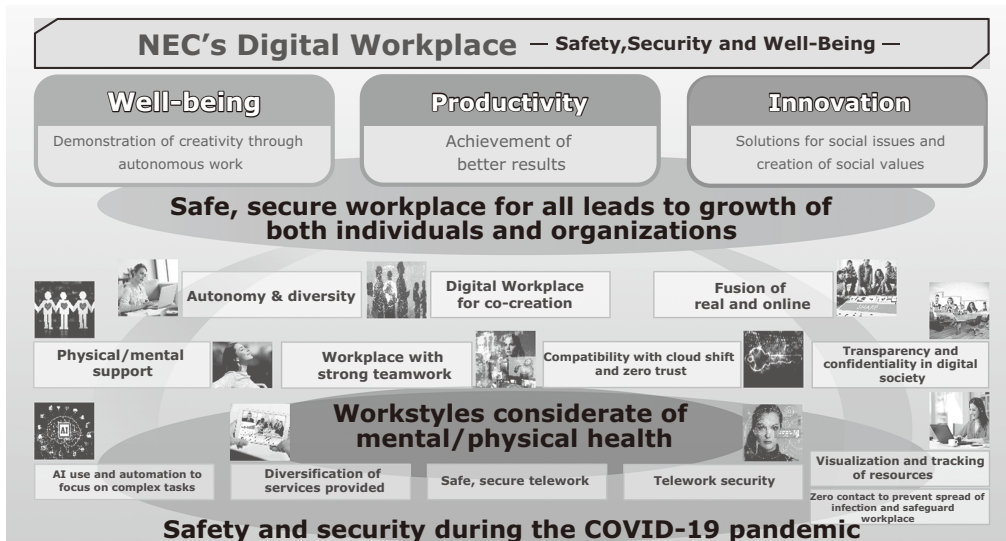
Fig. 2 Concept of NEC's Digital Workplace.