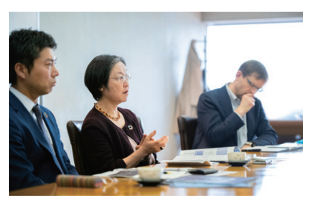
Photograph from left: