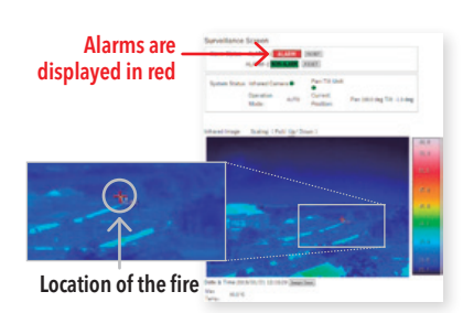
Fire detection screen image using infrared camera

Based on the results of the implementation evaluation, we will improve the system and its operation, with a view to full-scale introduction and expansion in fiscal 2020.